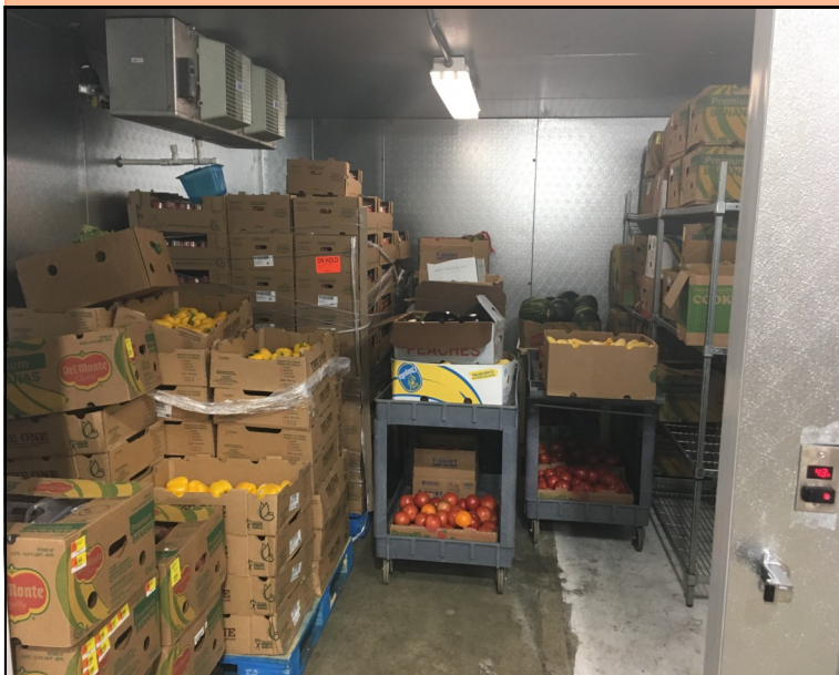
The new refrigeration unit can store more produce, and allows easier access, with the no-barrier entry and an extra large door, for pallets of produce! Beckner's Farm and the Booker T. Washington garden have supplied an abundance of produce during the summer months!